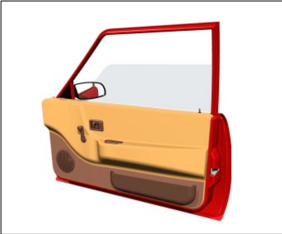
I-DEAS Master Surfacing allows you to directly incorporate styled surfaces from Imageware™ Surfacar® or other styling packages, and use them to associatively drive the feature-based design of complex components and assemblies.

Sample situations that can be addressed with Variational Sweep are: